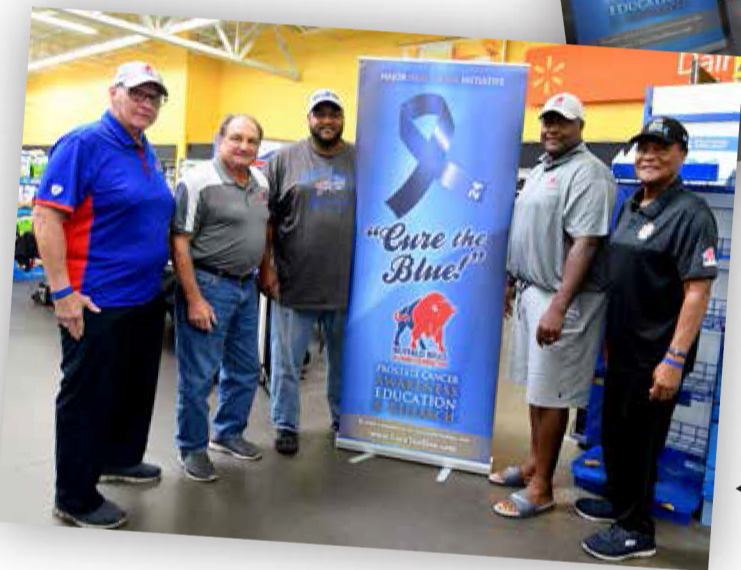
◀ Alumni appeared at several Walmart stores during Prostate Cancer Awareness Month.