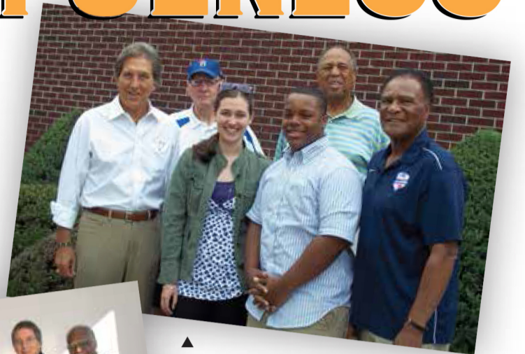
▲ Alumni present annual NFLPA scholarship to two of Buffalo's outstanding seniors.