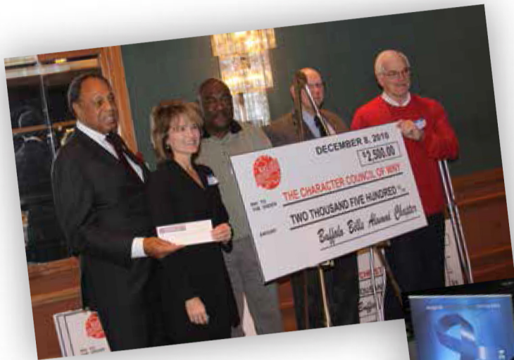
◀ Bills Alumni present donation to the Character Council of WNY.