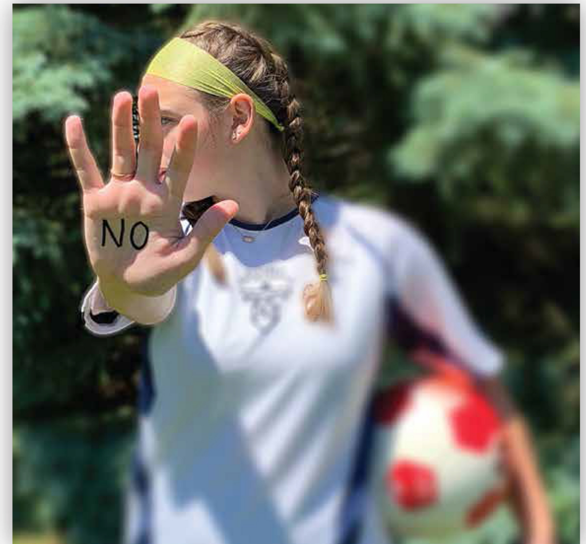
I won't let peer pressure stand in the way of my dreams – I choose SOCCER!